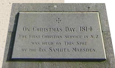
Inscription found on the base of Marsden Cross, Oihi Bay, Bay of Islands.

Ka whakatenetenehia ai te mīhana karaitiana i ētahi pekanga, engari ko te karere a te rongopai, i huaina ia e Te Matene i te tau 1814, e rere tonu ana te mau o ōna kauheke e te tini o te ao Māori puta noa i te rua tekau rautau heke rawa iho ki nāianei.