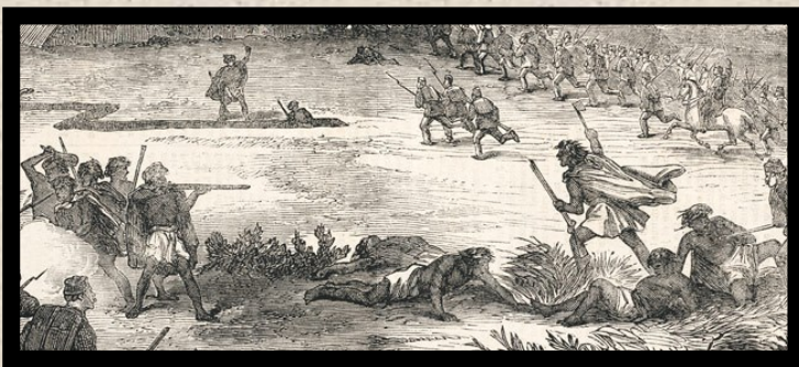
Artist unknown :A fresh war in New Zealand; capture of a native stronghold by a British force - "Penny illustrated paper", 7 November 1868 - 6 February 1869].

Leading Christians including missionary Octavius Hadfield spoke out against the government's land dealings in Waitara, Taranaki. A few years later, however, a Christian critique of the 1860s wars and confiscations was lacking. Some Māori perceived Pākehā church leaders as supporting Crown military forces, even though many did not intend to take sides in the conflict. In some instances, church leaders supported the Crown's prosecution of the war against the Kingitanga and other Māori.