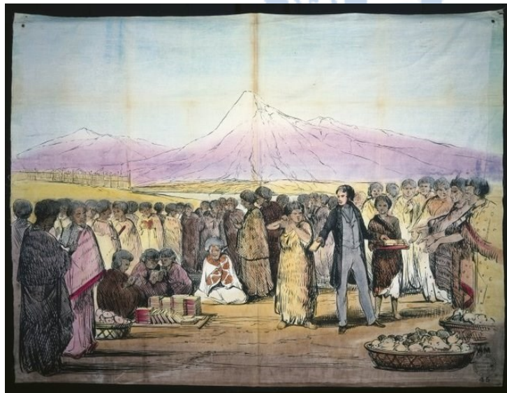
Working Men's Educational Union :[Missionary wall pictures]. - London ; Working Men's Educational Union, [1850s?]. Ref: F-029.

Following requests by iwi leaders for British intervention in a changing and challenging geopolitical milieu, Protestant missionaries brokered the 1840 te Tiriti o Waitangi/the Treaty of Waitangi. They supported the document believing it was the best chance of protecting Māori interests in the face of increasing British settlement. Missionaries carried and explained many of the nine treaty sheets that were signed by Māori throughout the country. In areas where Christian mission teaching had taken root, especially in Northland, some Māori understood the Treaty as akin to a biblical covenant.